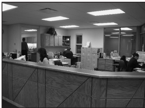
Left: Main Office