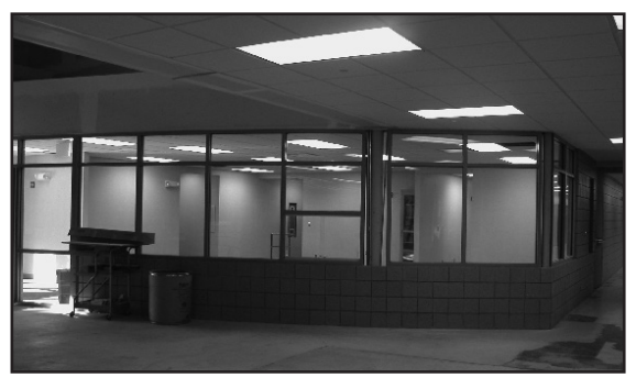
MAIN OFFICE - The office will still be located near the old main entrance, but the principals and some support staff will be located in the new circular addition.