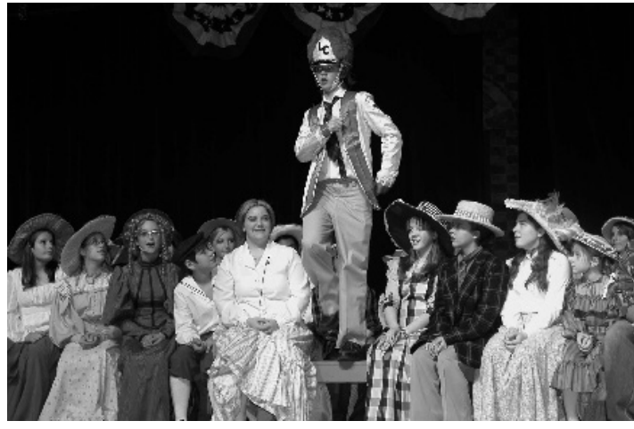
MUSIC MAN - There were 50 CMS students who were in the cast of the Music Man Jr.

pay for a portion of the musical along with various Columbus patrons helping with the costs