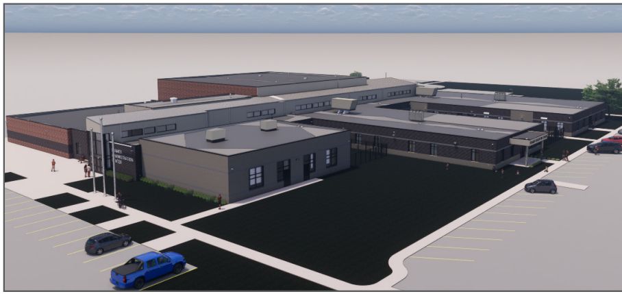
This artist rendering shows the southwest view of the Kramer Education Center. Located at the site of the old middle school, on 16th Street, between 25th and 23rd Avenues the building will be home to a preschool center, day care and the administration team.

He noted, because ICF, anyone who drives past the location can see how quickly the new walls were put up.