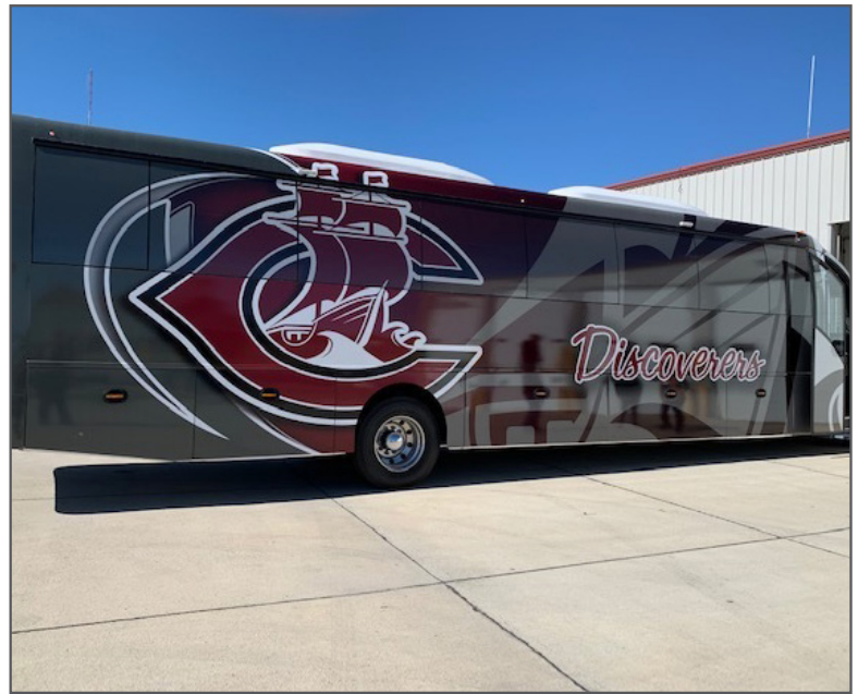
Columbus Public Schools updated the Discoverer Fleet. Be sure to show your maroon pride and shout "Go Discoverers!" when you see it traveling across the state of Nebraska.