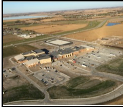
Aerial view of new high school.