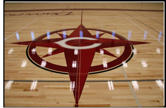
Center court of the main gym.