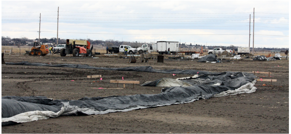
STILL WORKING - Work continues on the new high school.

In November, the high school rolled out a comprehensive technology program. Each high school student received an 11" MacBook Air Computer to use for instructional purposes. It was time for CPS to move forward in engaging our students to be ready for the Global World in which