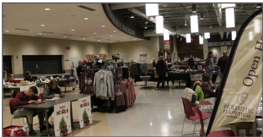
Throughout the night, shoppers had a chance to get their CPS gear as the Discoverer Spirit Shop was open.

Stay tuned for Lighting of the Anchor 2020!