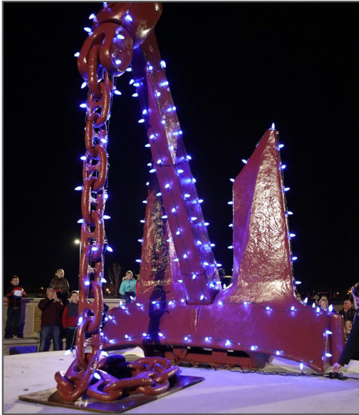
The Anchor, outside Columbus High School, unveils its lights during a community-wide event in December.