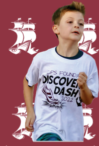
'ON DASHER(S)!' Discoverers Dash Photos, Pg 8.