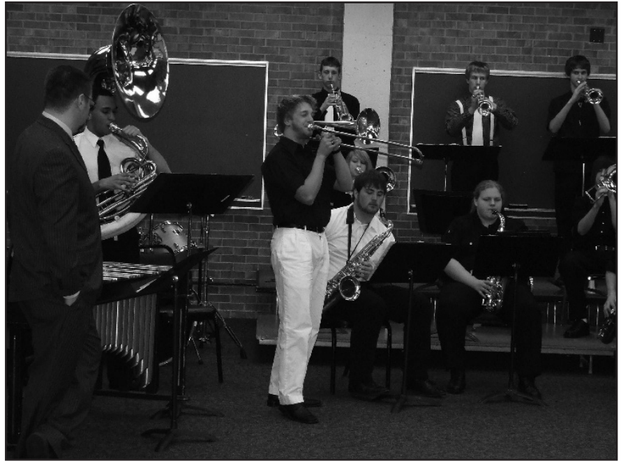
SHOWING OFF THEIR SKILLS – The Columbus High School Jazz Band showed a professor at DePaul University their musical skills. They worked with him for a couple hours.

professor offered tips to improve their sound.